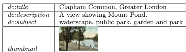
Table 1 Example Europeana item demonstrating the kind and amount of meta-data available to the hierarchy algorithms. The thumbnail image was shown to the users in the evaluation, but is not used by any of the hierarchy algorithms.

We make use of three pieces of information from the Europeana metadata (see Table 1 for an example). The dc:title , dc:description and dc:subject fields that contain textual information describing each item. These fields were chosen since they are more informative than other fields in the meta-data and also tend to have been completed more consistently than other fields by the institutions that provide information to Europeana. 99% of records have a dc:title , 74% a dc:description , and 64% at least one dc:subject value. The dc:title and dc:description provide short pieces of textual information about the item. The dc:subject field often links the item to an existing hierarchy, but not all providers have done this (i.e. the information is incomplete) and providers have also used a wide range of different hierarchies without documenting which one was used. For evaluation purposes, but not in the hierarchy creation process, we also used the thumbnail images provided by Europeana.